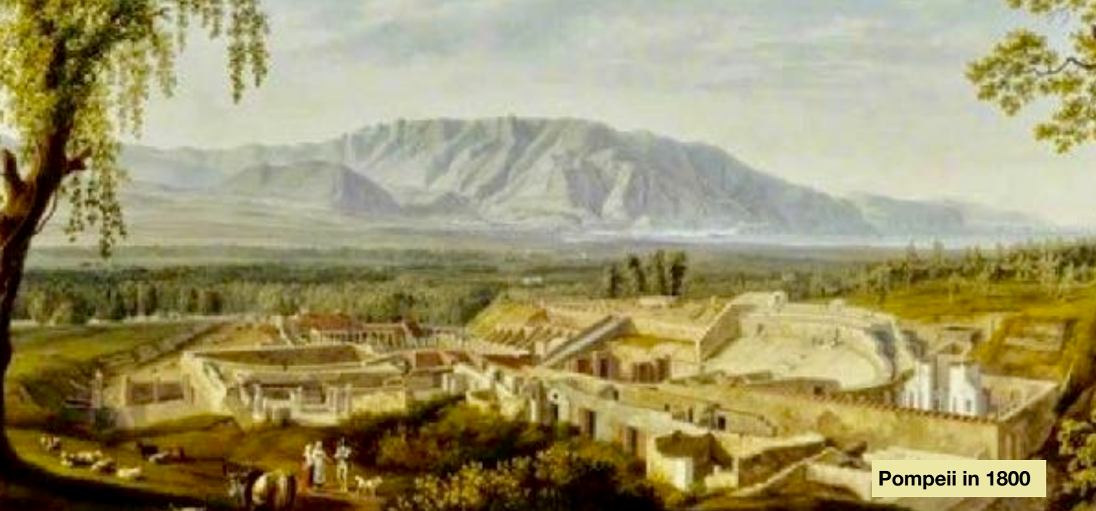
Pompeii in 1800