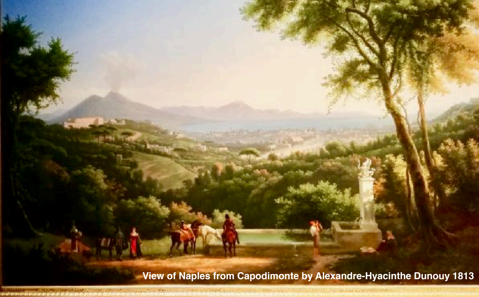
View of Naples from Capodimonte by Alexandre-Hyacinthe Dunouy 1813