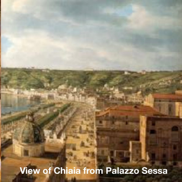
View of Chiaia from Palazzo Sessa