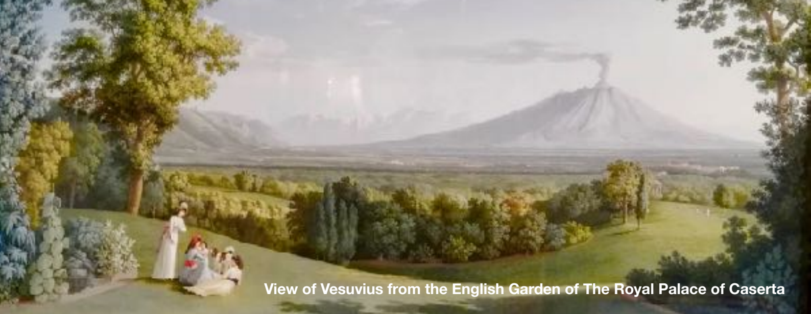
View of Vesuvius from the English Garden of The Royal Palace of Caserta