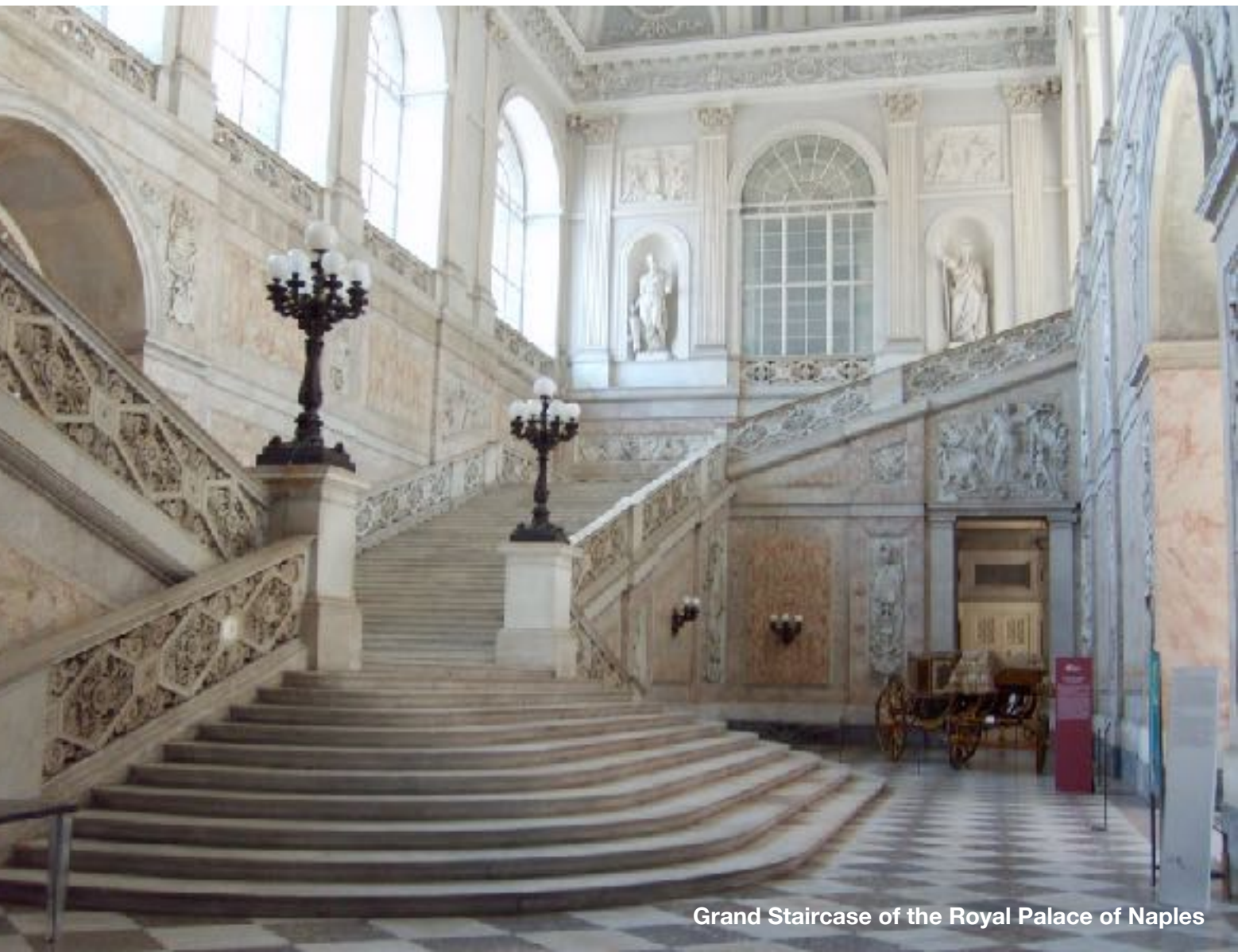
Grand Staircase of the Royal Palace of Naples

Please note that single rooms are expensive and rare. Sharing a hotel room or an apartment will reduce the cost and sharing means assistance with dressing! Let me know if you would like me to find someone to share a room with. If you need some help choosing accommodation, write to me at my email address. margaritafm@yahoo.com.au