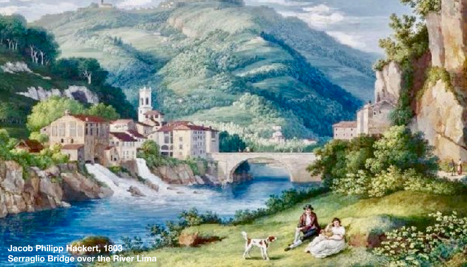
Jacob Philipp Hackert, 1803 Serraglio Bridge over the River Lima