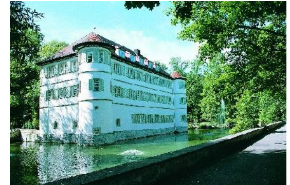
Castle Bad Rappenau (early 17th century)