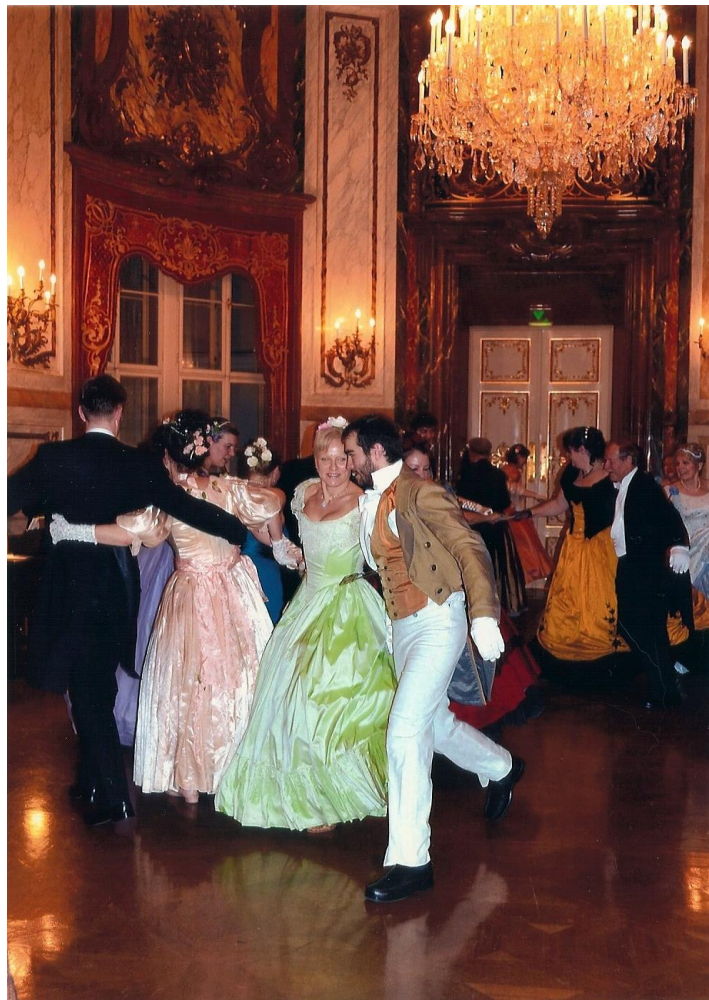
Ball in the Daun-Kinsky Palais, February 2013

Her current research for her theses is on Viennese Balls of the 19th century (Institute for musicology). During the dance week she will present her latest results. Thanks to her knowledge she can bring back to life the unique features of these social events.